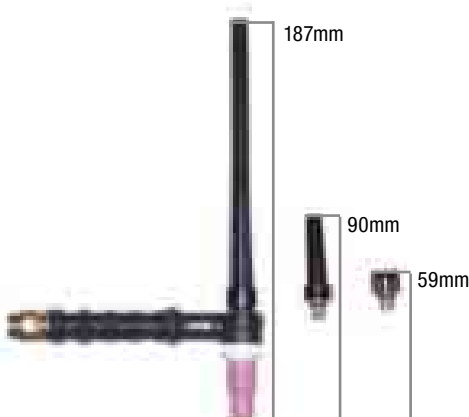
Høyde / Linse utstyr