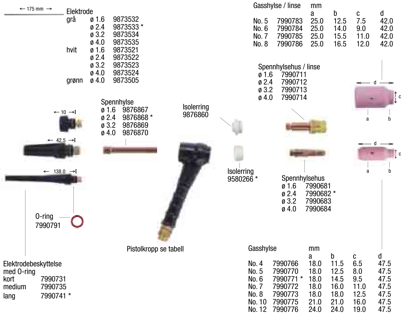
Høyde / Standard gasshylse

Stort pistolhode: TTK 160, 220, 220S, 350W, TTC 160, 220, 250W